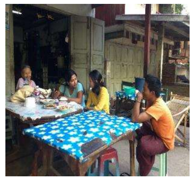
Interview with a migrant worker, Mandalaya

The field visits involved rapid and intensive two-week expedition to the selected study sites, where a number of various stakeholders were interviewed. These included migrants in both origin and destination areas, including migrants' families in origin areas, labour agents (who facilitate migration process), township officials, private sector employing migrants, farmers, civil society and other key informants. As there was no quantitative data collection and as the study is based on the "expert opinion", the findings of the study are of qualitative value; including several case studies. However, in order to ensure consistency of the findings, same information was collected by interviewing different stakeholders involved in a given sector. For example, in rubber plantations, the information pertaining