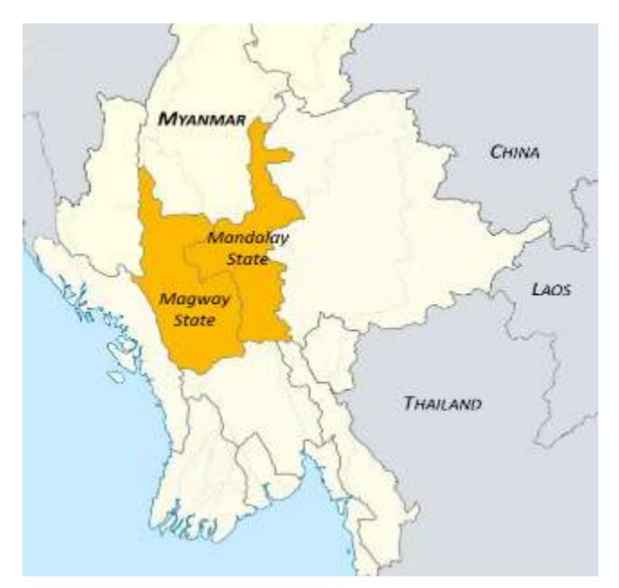
Figure 6: Magway & Mandalay State

Most young males with slightly higher education (8-10 years of schooling) find jobs in res-