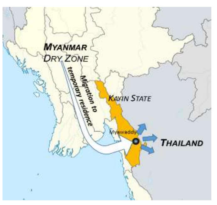
Figure 2: Cross-border shuttle migration

Whereas internal migration is more a survival strategy, international migration, when successful, has a clear wealth accumulation objective. The most important factor in progressing from internal migration to international is the existence of social networks to