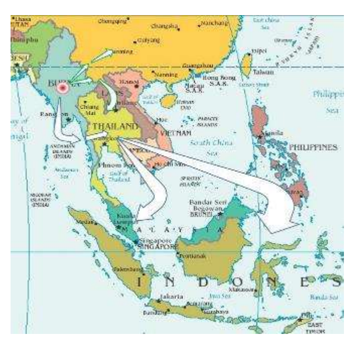
Figure 3: Progression of migration pattern from the Dry Zone

The preference for international migration, particularly to Thailand and China, is due to the higher wages. For example, daily wages for working in construction, rubber and agriculture sectors in Thailand and China range from 16-32 USD as compared to similar work in Myanmar for 6-13 USD. Or a semi-skilled person (scaffolder, plumber, and painter) can earn 16,000 Kyat per day. At home, daily wage rate is 3000 Kyat per day. So in Thailand, the wages are 3.5 times higher and living costs much cheaper. The cost and returns of a successful cross-border migration is given in the box below, which clearly illustrates the attraction for young people to progress from internal to international migration. The return from international migration, when successful, is high enough that it can make a significant shift in the socio-economic situation of the household, which is well beyond